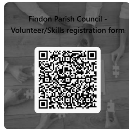
Volunteer/skills registration form